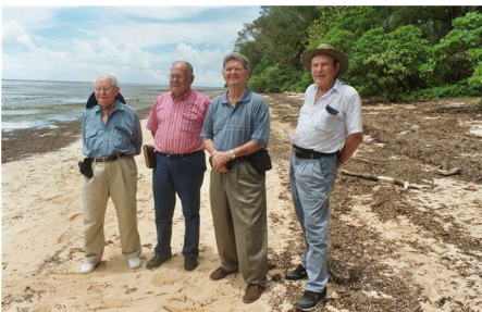
WWII Veterans stand on one of the invasion beaches during our 60 th Anniversary return to Peleliu