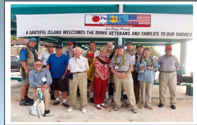
60th Anniversary group of Veterans at Peleliu, 2004