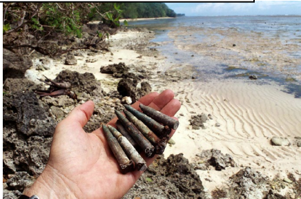
Evidence of the battle still washes up on the beach