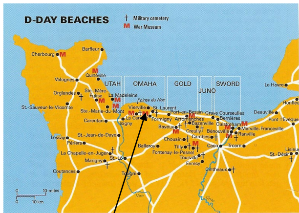
Location of hotel

The personally guided tour packages listed below are subject to availability. Call Valor Tours, Ltd. with your preferred dates and we will respond within 5 working days. A 20% deposit will be due at that time. Final payment due 30 days before arrival in Bayeux. Cancellations received up to 30 days prior to arrival date fully refundable; cancellations received within 30 days of arrival dates subject to 20% cancellation penalty. "No shows" non refundable. Not included in independent packages are cancellation/travel insurance (available upon request), transportation to/from Bayeux, lunches and dinners, and items of a personal nature such as laundry, bar drinks and phone calls and entrance fees to museums.