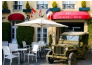
Hotel in Bayeux

Take the train from Paris to Bayeux. About 2 hours.